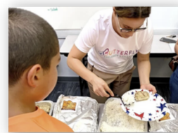
Scenes from our fundraisers and community events

5. Butterfly Children's Charities: The volunteer-run organization of mainly women in the Parkland/Coconut Creek/Boca Raton area held its second charity golf tournament in Deerfield Beach. The event, staged at Deer Creek Golf Club, raised funds for SOS Children's Villages in Coconut Creek and Liberty Children's home in Belize as part of its mission to support abused, neglected and orphaned children at home and abroad.